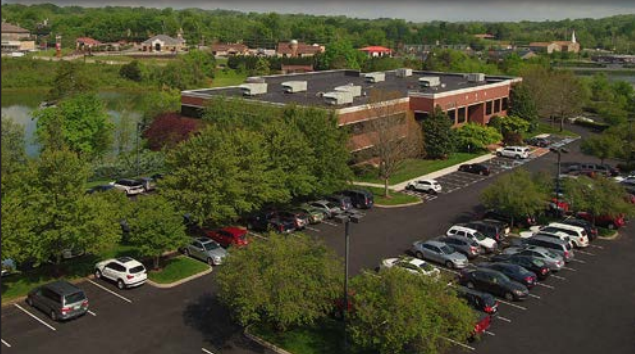
One Lakeside Centre - 64,040 square feet