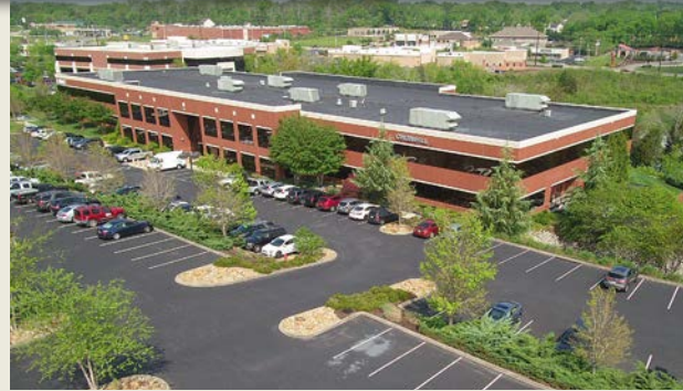
Two Lakeside Centre - 96,336 square feet