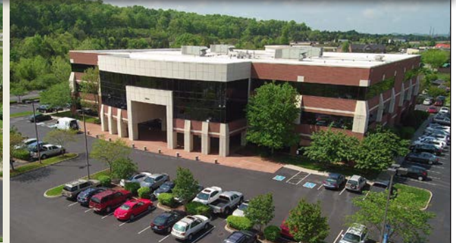
Three Lakeside Centre - 98,639 square feet