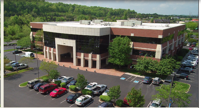
Three Lakeside Centre - 98,639 square feet