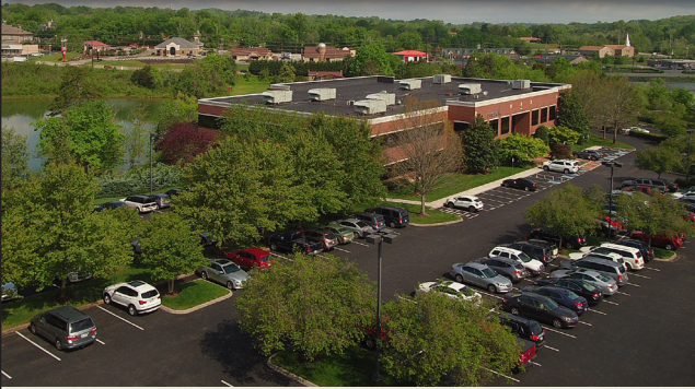
One Lakeside Centre - 64,040 square feet