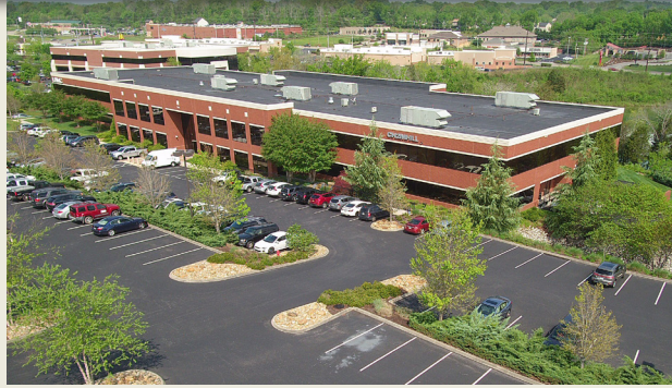
Two Lakeside Centre - 96,336 square feet